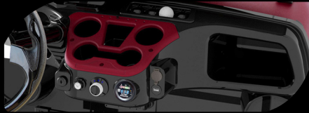
Color matched Dash with four cup holders/cell phone holder