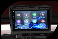
9 inch touchscreen with back-up camera