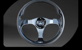
Luxury steering wheel