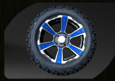
14" Color matching Off Road Tire