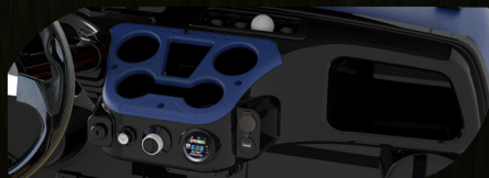
Color matched Dash with four cup holders/cell phone holder