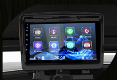
9 inch touchscreen with back-up camera